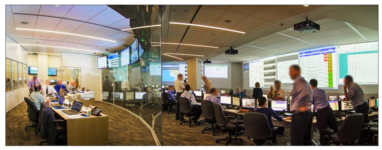
Figure 2: NRC's Headquarters Operations Center