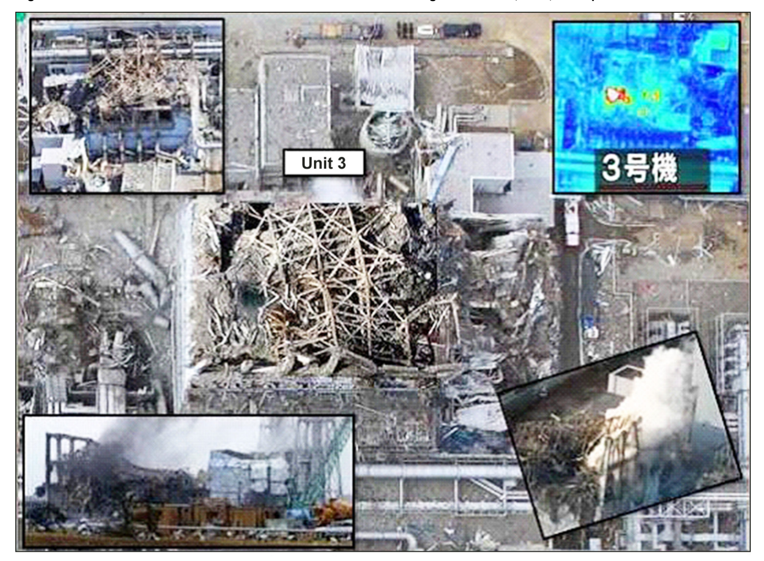
Figure 1: Unit 3 of the Fukushima Daiichi Nuclear Power Plant Following the March 11, 2011, Earthquake and Tsunami

shut down pending a complete safety review and, as of this writing, all reactors have been shut down. It is uncertain when these reactors will be brought back online. Figure 1 shows Unit 3 of the Fukushima Daiichi nuclear power station following the March 11, 2011, earthquake and tsunami.